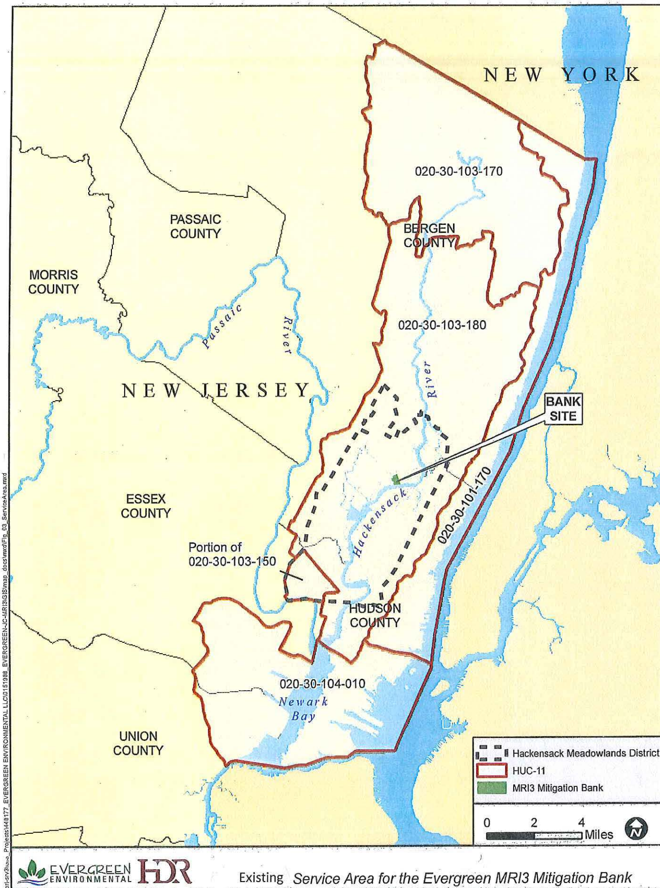
Figure 1 of 2